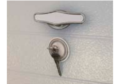
Outside keyed lock