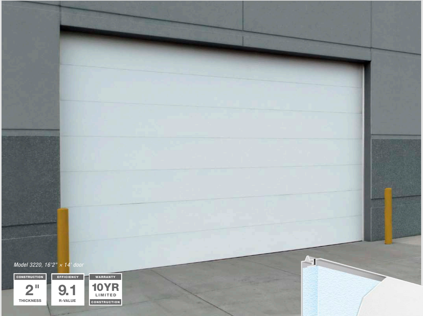
Model 3220, 16'2" x 14' door