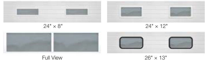
24" × 8"