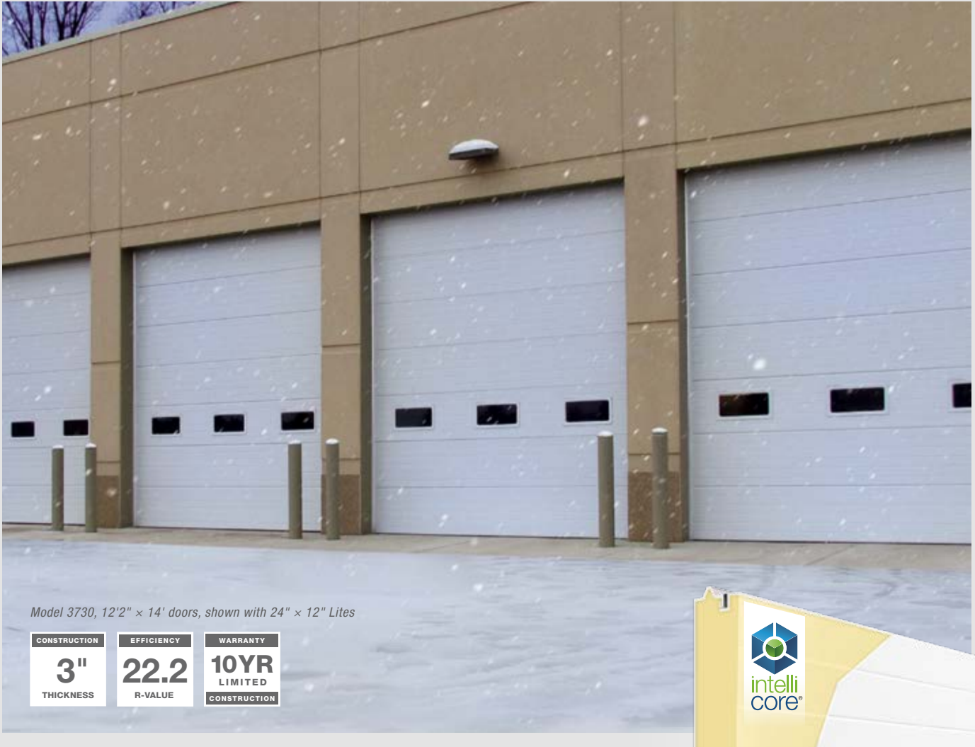
Model 3730, 12'2" x 14' doors, shown with 24" x 12" Lites