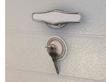
Outside keyed lock