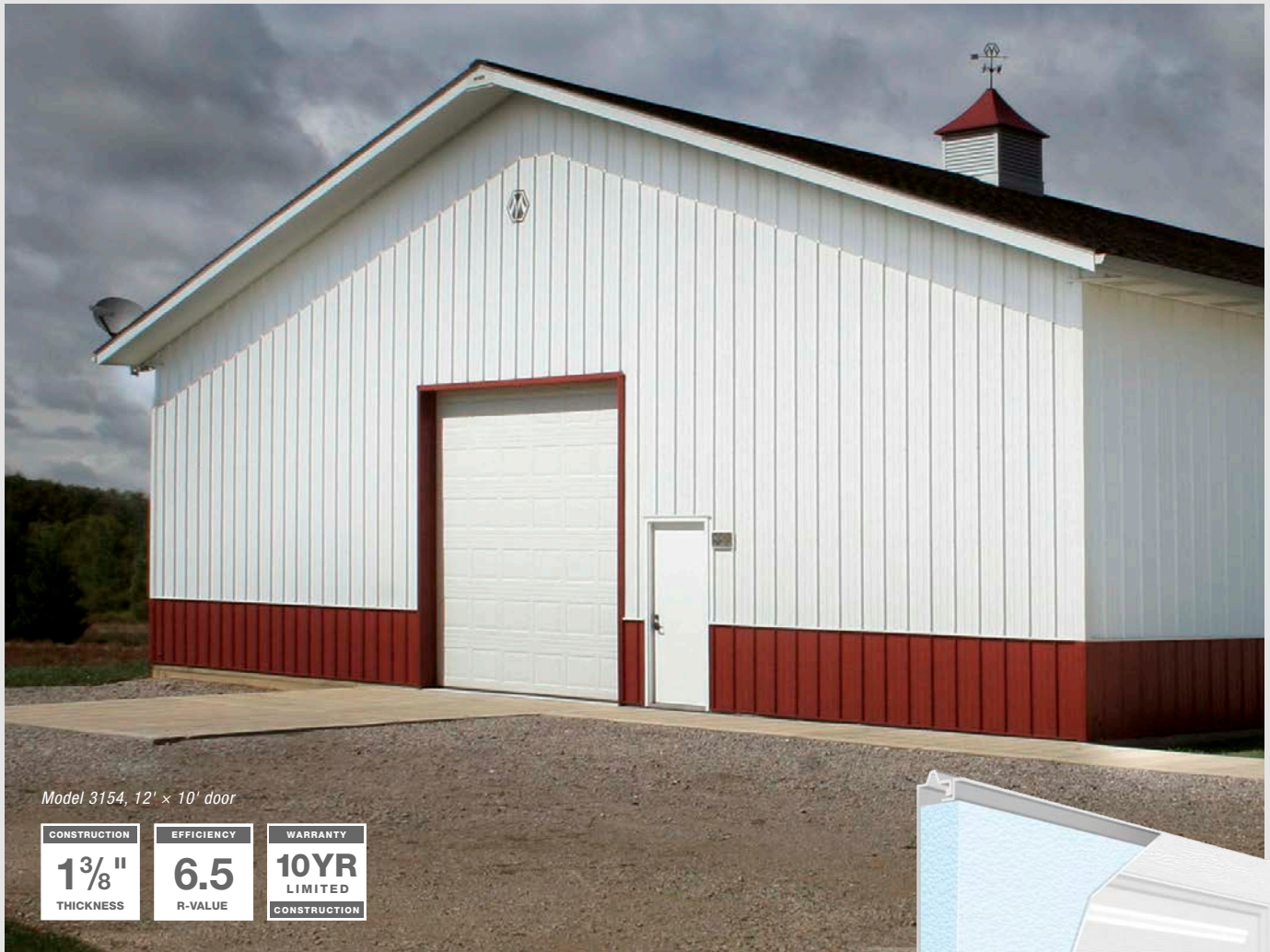
Model 3154, 12' x 10' door