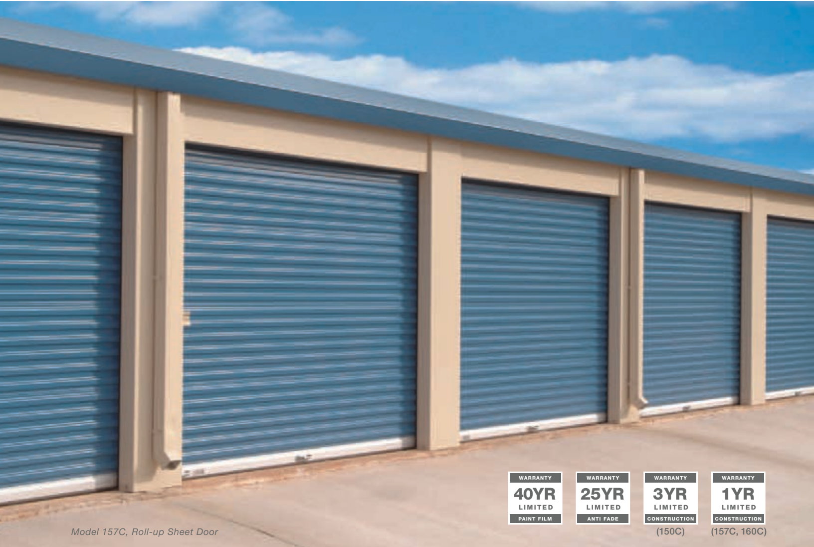
Model 157C, Roll-up Sheet Door